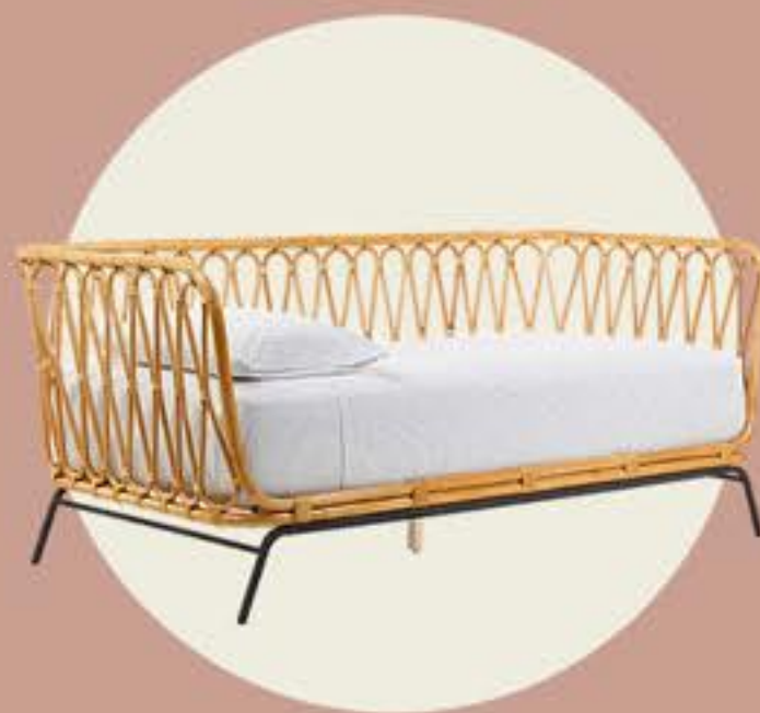
Rattan Twin Daybed, Crate&kids ($999)