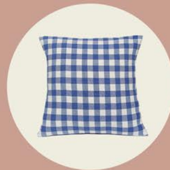
Gingham Pillow in Denim, Heather Taylor Home (from $125)