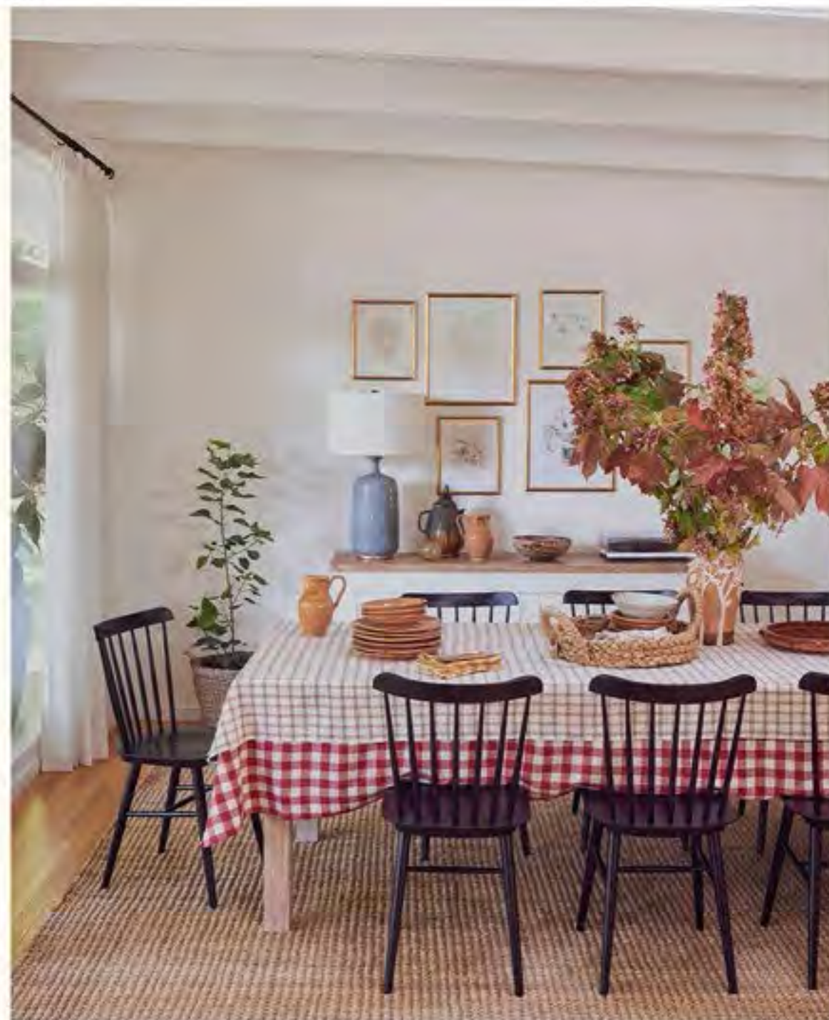
Top right: Cement Tile, Granada ; Bench Cushions in Juniper Fabric, Heather Taylor Home ; Nesting Baskets by Bunny Williams, Ballard . Above, from left: Handmade Ceramic Candlestick Holders and Antique Rosa Daisy Planter, Nickey Kehoe ; Floral Tableware, The Ivy ; Gingham and Juniper Tablecloths, Heather Taylor Home ; Salt Chairs by Ton, Design Within Reach ; Sandbar Tray, Serena & Lily ; Jute Bouclé Rug, West Elm .