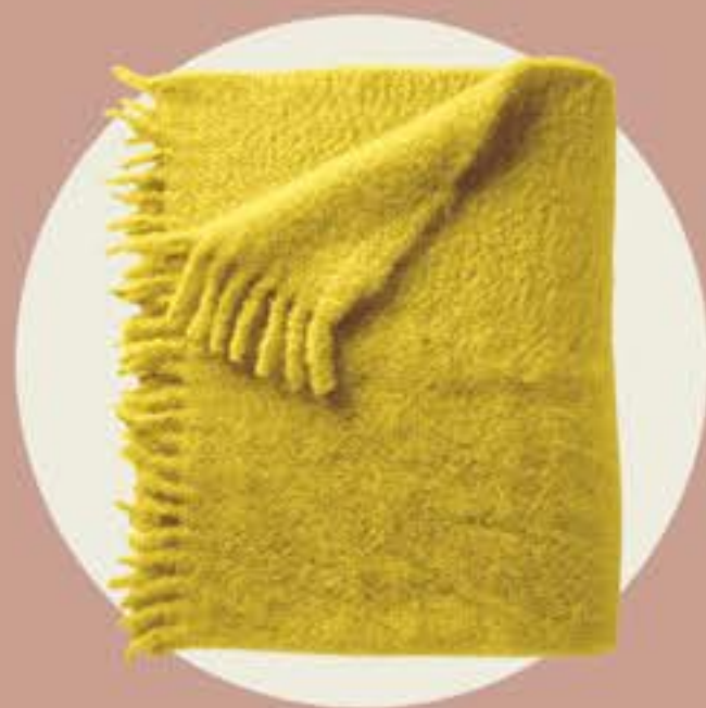
Albion Mohair Throw, Serena & Lily ($448)