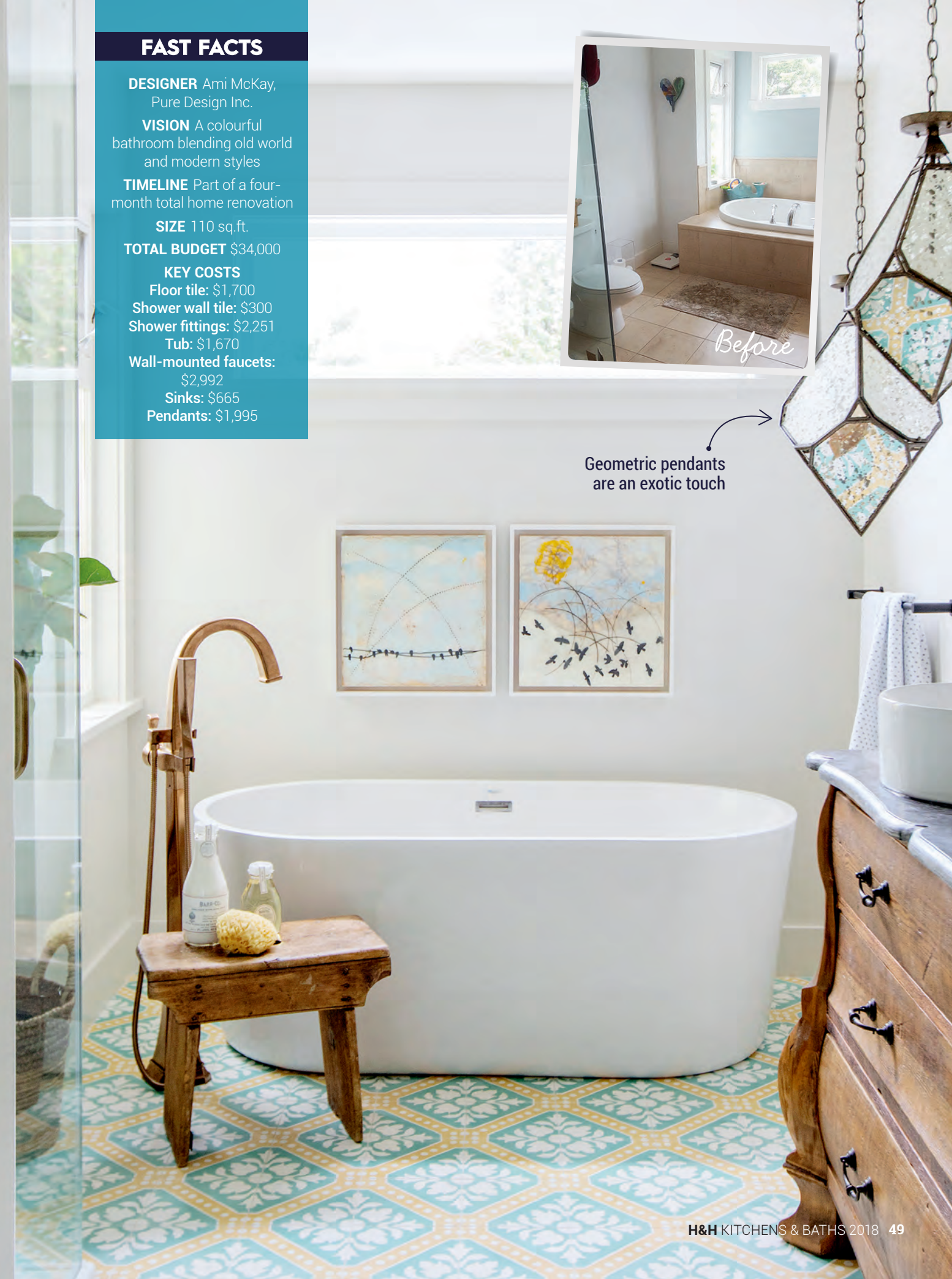
Geometric pendants are an exotic touch