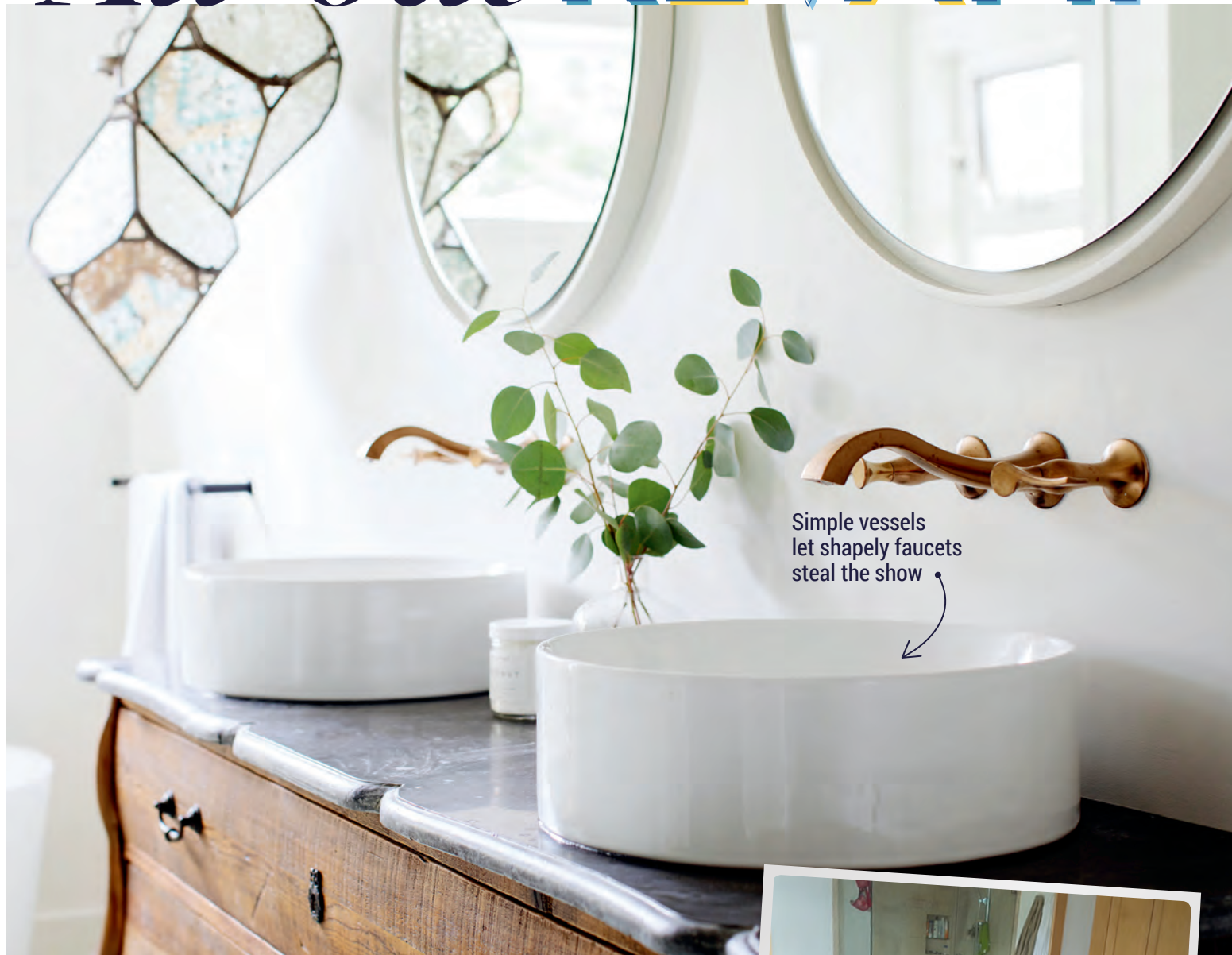
Simple vessels let shapely faucets steal the show