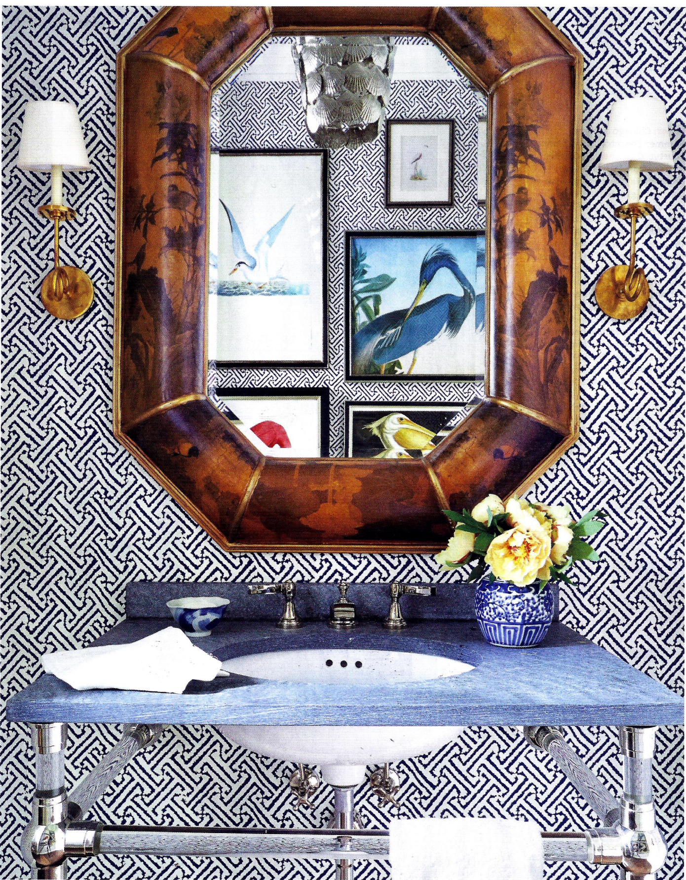
ABOVE: Java Grande wallpaper from China Seas is a bold backdrop for the powder room. The mirror is vintage. Gramercy Glass washstand, Restoration Hardware. OPPOSITE: Calais tiles from Granada Tile enliven the lanai and carry the home's profusion of blue and white outdoors. Wicker furniture from Kingsley-Bate with cushions in Perennials' Rough 'n Rowdy fabric surrounds the Bornova coffee table from Ballard Designs.