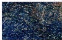
Blue Fusion Q722 A swirling sea of blues and greens.