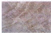
Crystallize Q705 Cream with ribbons of grey and gold.