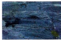
Ocean Tide Q716 Blue strokes that look like brush marks.