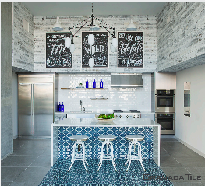
Design: Ariel Fox Design Photographer: Manolo Langis

Kitchens deal with heavy foot traffic, spills, dropped plates, and more activity on a daily basis. Cement tiles are resistant to moisture, chips, and heavy usage, and offer plenty of room for creativity. Cover the entire floor for practical measures and then add some interest with a faux rug in front of the sink and a border around the base of the island with cement tiles.