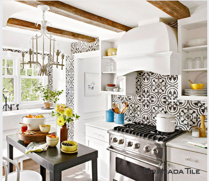
Gorgeous Decorative Tile Ideas, Better Homes and Gardens Moroccan tile Backsplash