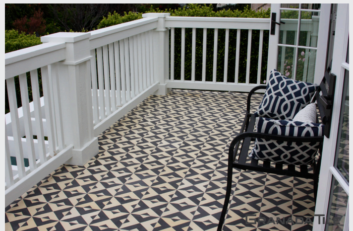
Design: Jill Burnham

Chip and moisture-resistant cement tile is an excellent choice for an outdoor patio floor. It can hold up to the weather, heavy foot traffic, and scuffing of furniture without cracking, chipping and losing its luster.