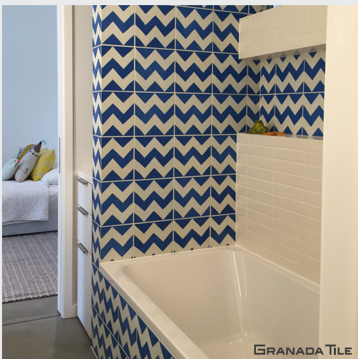
Design: Pfau Long Architecture

Ironically, bathing isn't always the cleanest of activities. Combat water damage and mold with cement tiles that are moisture-resistant and non-slippery for your bathroom floors.