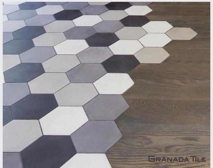
Design: House of Honey

The shower needs the most moisture fighting power and cement tiles couldn't be a better or more stylish option. If the rest of the bathroom is simple and subdued, tile the entire shower, floor to ceiling, in a bold pattern