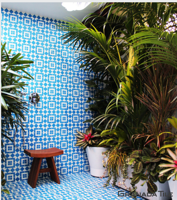
Design: Adrianna Lopez

One of the hottest trends in home design is blurring the lines between indoors and out. If you've been dreaming about your own outdoor kitchen, consider using durable cement tiles underneath the counter, on the floor and as the backsplash.