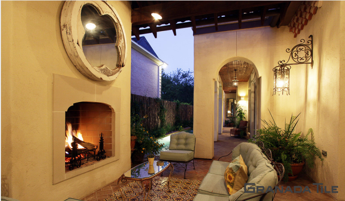
Design: Jennifer Hamelet , Mirador Builders

Install cement tiles on the backsplash in your laundry room and tie it into the floor using the same solid colored tile for a soothing, serene atmosphere in white or light gray, or make laundry time something you look forward to with a fun pattern.