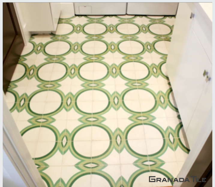
Design: Hatch Works