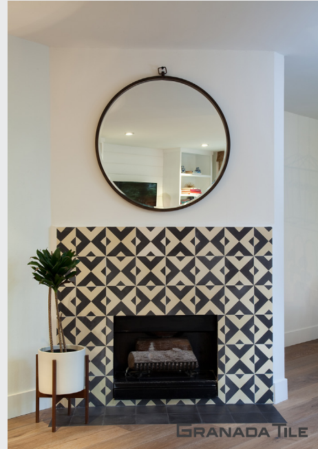
Design: Studio Matsalla