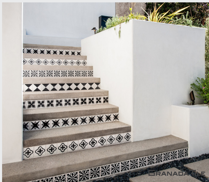
Design: Michael Canty

Who says walkways and front steps have to be plain cement or bricks? Cement tiles offer the same level of durability and weather resistance but with all the style and creativity you love for the inside of your home.