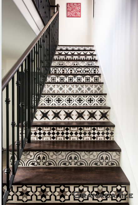
Design: Michael Canty

For many homeowners, the living room is the favorite place to show off prized works of art, gorgeous antique mirrors, and family pictures. You can create your own art pieces and enhance others you already have by tiling the walls of the living room with cement tiles. Use a single solid colored tile all over the wall, make built-in shelves pop with background cement tile, use multiple styles on a feature wall, or frame pictures or paintings with cement tile borders.